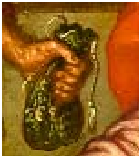
Spanish School, c.1529, Christ Washing the Disciples' Feet (Detail)

Judas, the archetypal betrayer, is depicted with a bag of money which could be in reference to the following event: when the Jewish chief priests and elders were plotting to have Jesus arrested and put to death, Judas asked them what they would give him to betray Jesus. They promptly offered Judas thirty pieces of silver. Here he is holding either that promised silver or the disciples' money, of which he was the treasurer. Judas is often accompanied by a demon, or some other creature, and it is possible that the little cat detailed by his feet alludes to this.